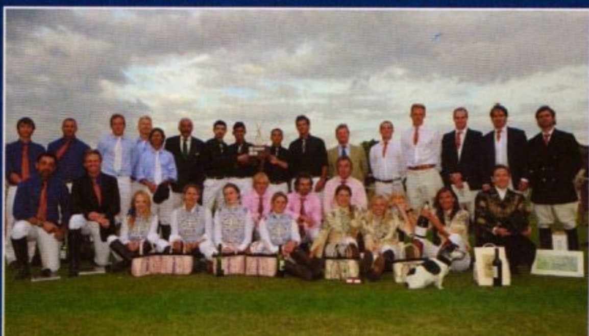
All teams turned out in traditional Victorian dress for the tournament